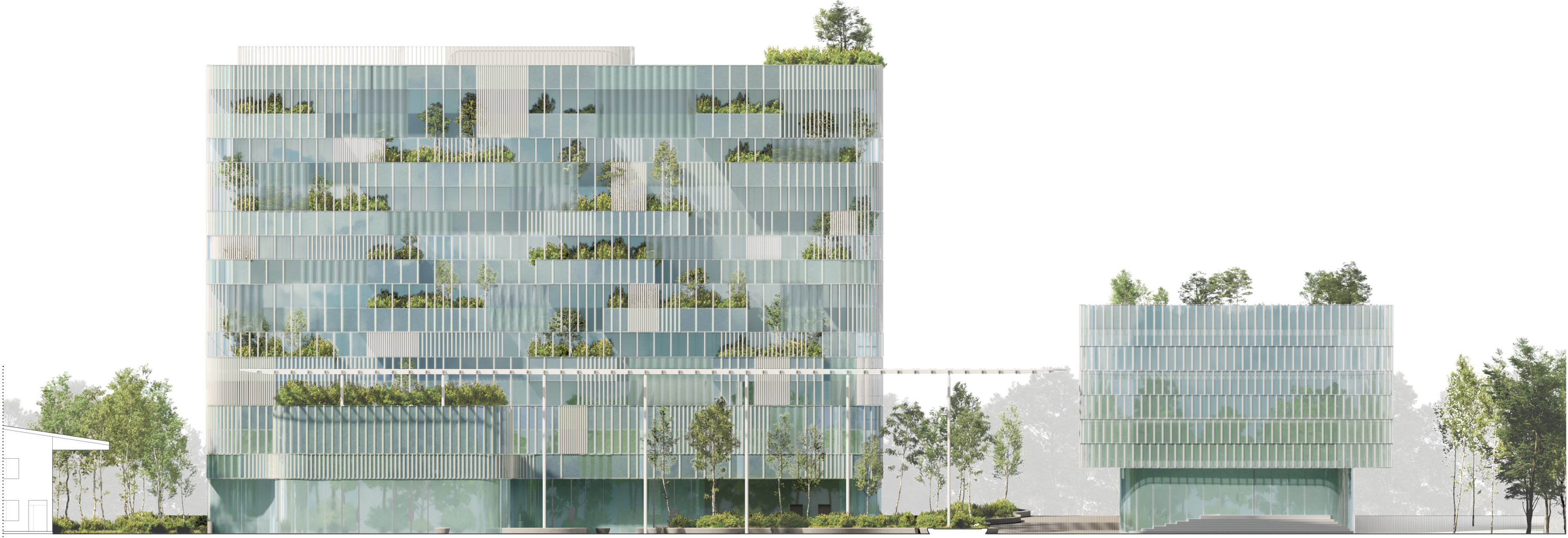
South elevation, scale 1:250