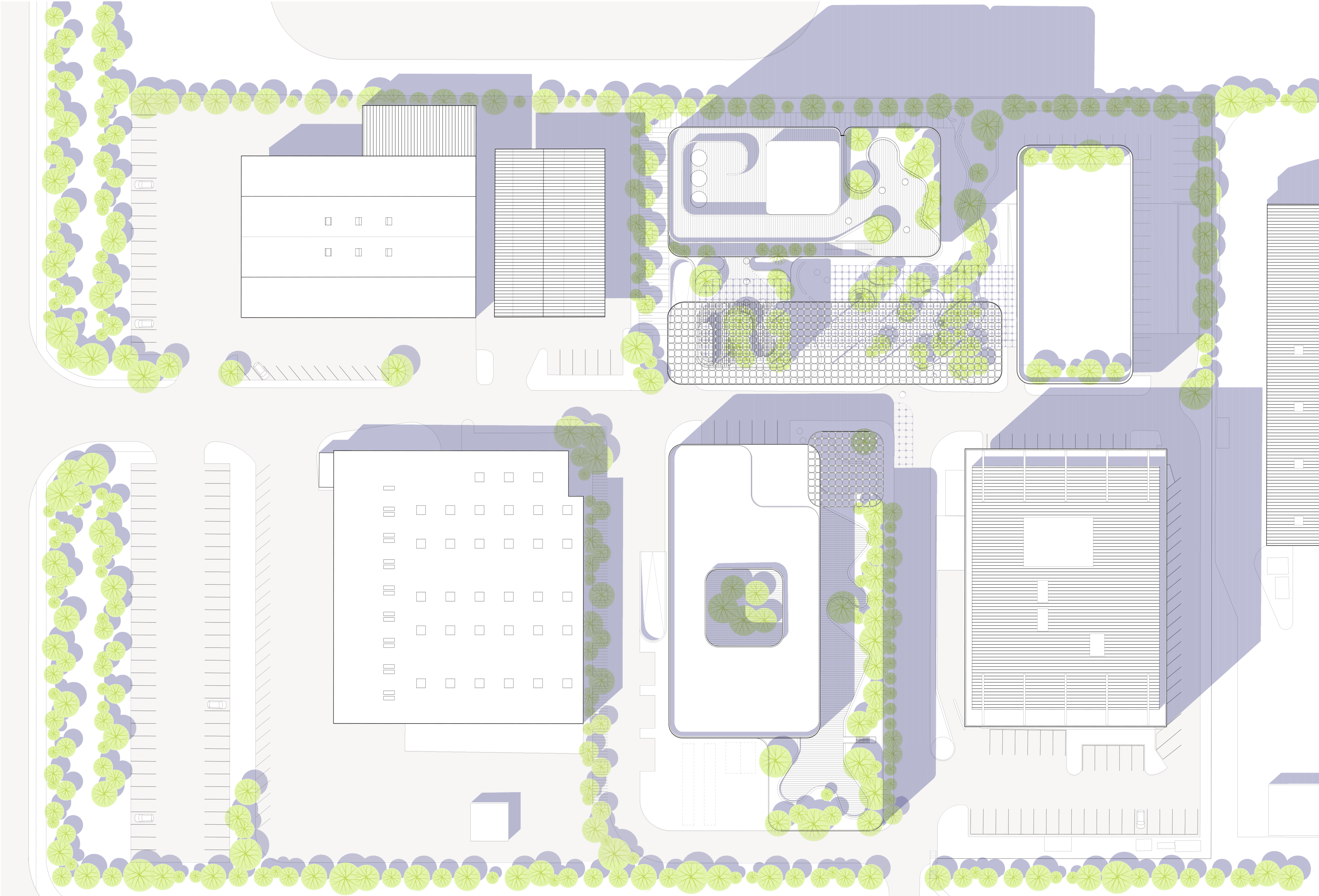
Site plan, scale 1:500